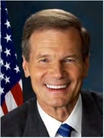
Sen. Bill Nelson