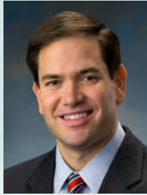
Sen. Marco Rubio