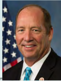
Rep. Ted Yoho District 3